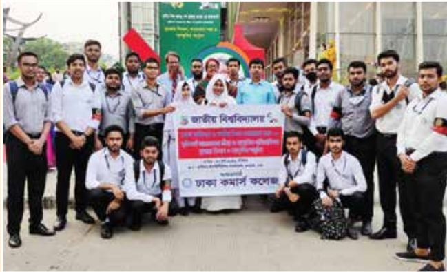
National University Prize Giving Ceremony

We will build the student as a well-educated and self-educated person through discipline, and diligence which will take you to the zenith of success in every sphere of your future life. Our careful nursing will establish a strong foundation of your future life. Your present preparation is indispensable for yourself and for the nation in future.