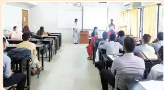
Students Presentation Program

A student earning D or more can opt for appearing in the Improvement Examination (except for Viva and Project Paper Defense) with next immediate available batch only, but only once for one course. In that case the earlier grade (and also the relevant marks, if any) earned in the course will be deleted. All midterm and assignment marks will remain unchanged in case of a student appearing in any improvement examination (i.e., improvement will depend only on the course final examination). In case of re-admitted students, the marks obtained earlier in the same semester courses only will be deleted from his/her record. However, a student will be usually readmitted in First, Third, Fifth, or Seventh semester only. In both the cases of retaking a course for failure or for improvement, a student must apply in specific form to the Controller of Examinations through the Head of the Department and through the Principal within 15 days of the publication of the provisional result. Semester results or yearly results (if combined for two semesters) will be considered as provisional.