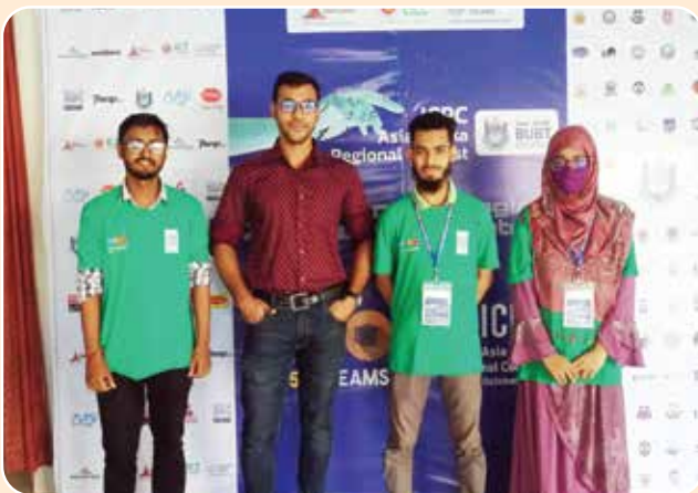
Students Participating in ACM ICPC Asia Dhaka regional contest final

Students will be supplied with books and materials which they will be required to read and understand. To develop sound study habits, arrangements are made for supervised reading in the library of the college. Students are required to prepare daily work assignments, participate in class discussions and sit for periodical quizzes and tests. Arrangements will be made to hold lectures and research seminars by prominent business executives or academicians on subjects of current business and research interest.