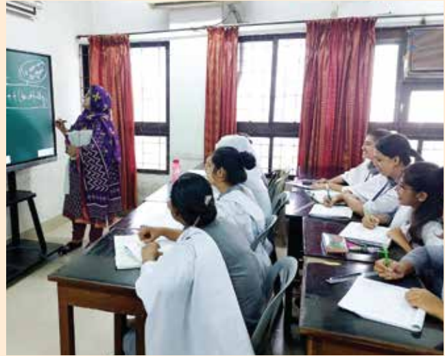
Class being conducted using Digital Board

Guardians (only ID card holders) are allowed to meet with the students during class hours only with the prior permission of the authority. Such permission is given in case of emergency.