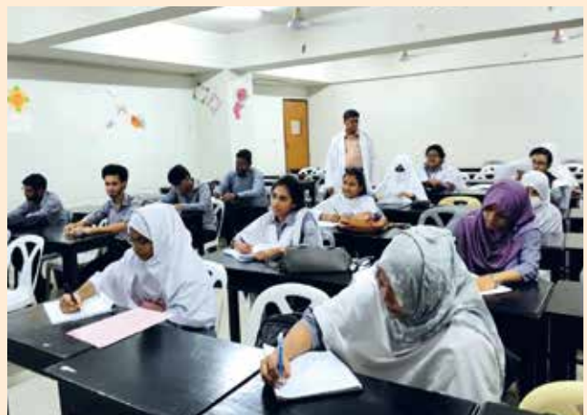
Students of CSE program are in the Exam Hall