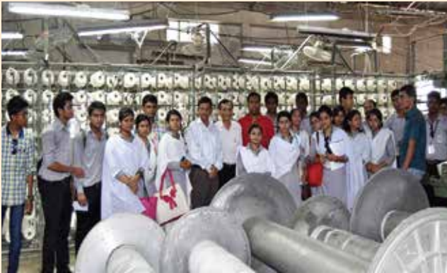
Industry visit: BBA students and Faculty members with the General Manager inside Asian Textile Mills Limited

There are clubs for Debate, Drama, Music, General Knowledge, Recitation, Rotaract, Readers & Writers, Language, Art & Photography, Dance, Nature Study, Business, Film, IT, Social Welfare & Science. Students flourish their potentiality being the members of these clubs of their own accord. Besides, the BNCC, Red Crescent Youth Team & Scouts are functioning as well.