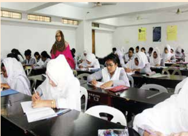
Students of BBA program are in the Exam Hall

Midterm examinations, tutorials, class tests, quizzes are held regularly with a view to flourishing their talent and for internal evaluation. Besides, students have to participate in case studies, presentations and submit assignment. It is mandatory for the students to take part in the internal examinations. In no way, students are allowed to remain absent from the examinations. Sick-beds are arranged for ailing students for conducting examinations. Admission is cancelled or transfer certificate is given to the students who remain absent from the examination.