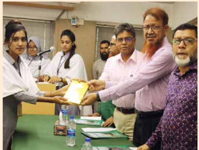
Principal, Vice-Principal and Department Chairman at the farewell ceremony of the first batch