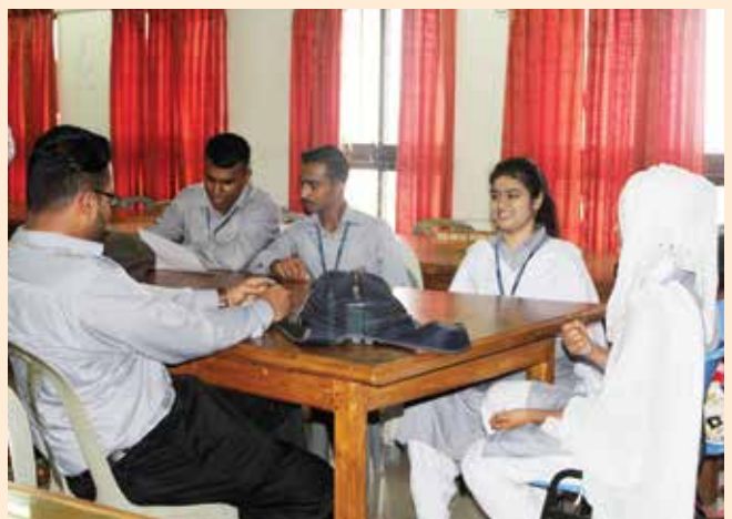
Students' group study in seminar

For the flourishing of leadership quality, students are assigned with various activities of the college and best activist or personality is awarded.