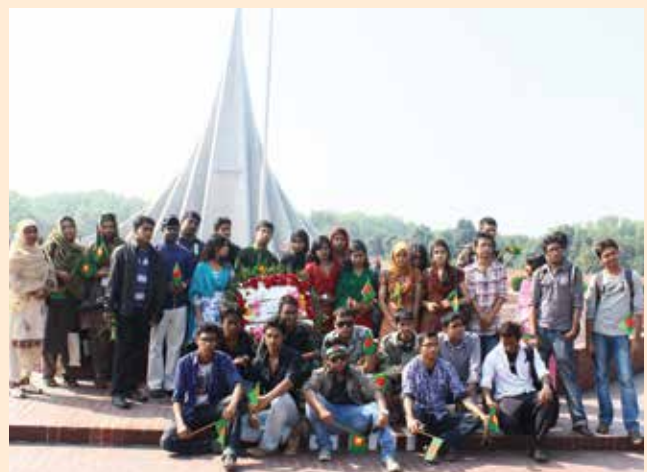
Students visiting National memorial

Even if needed be, the registration in the university may be cancelled. Any recommendation or persuasion about this will be treated as the double crime.