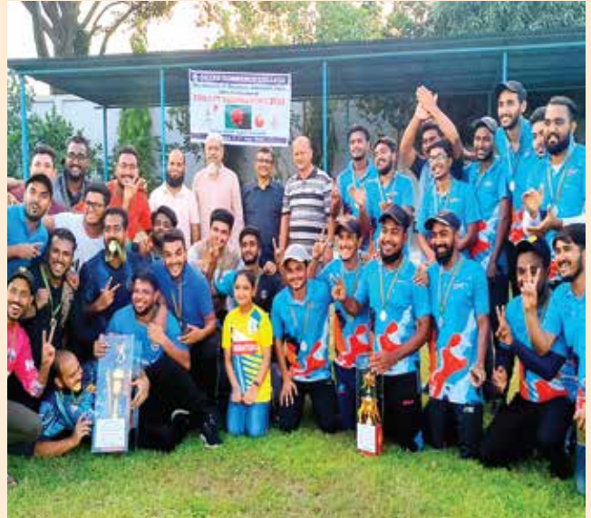
Inter Batch Cricket Tournament arranged by BBA Department

With a view to creating competitive mentality, competition on debates, sports, literary and cultural activities and on cleanliness are held among the students on the basis of section and class.