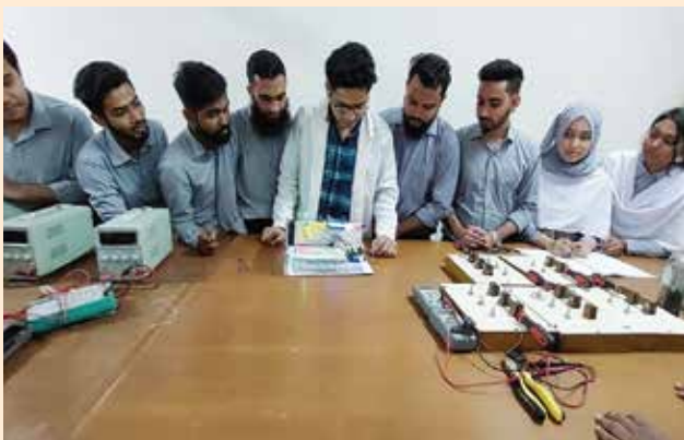
CSE EEC Lab

Our hardware lab has all the required equipment for practicing the hardware related courses. Students can learn by using them directly and practicing more. Our software lab has latest computers that support every software related to the course and also for extra learning. Students can even use the computer lab after class for more practice.