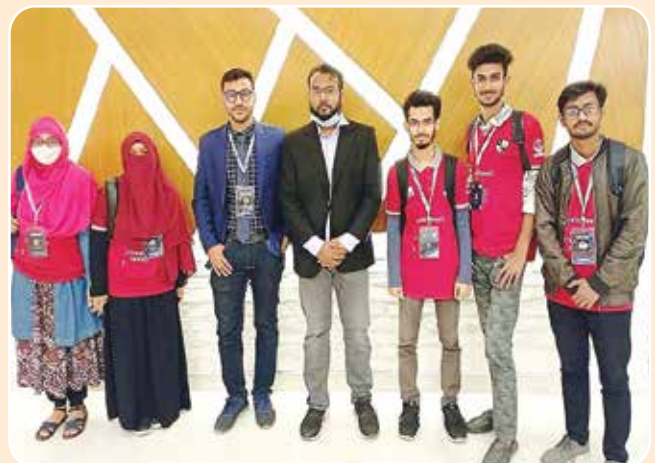
National University Affiliated Colleges "Program Contest" at Tejgaon College