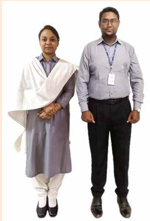
Uniform of the BBA & CSE Students

N.B. To enter the college for other purposes every student should put on college uniform.