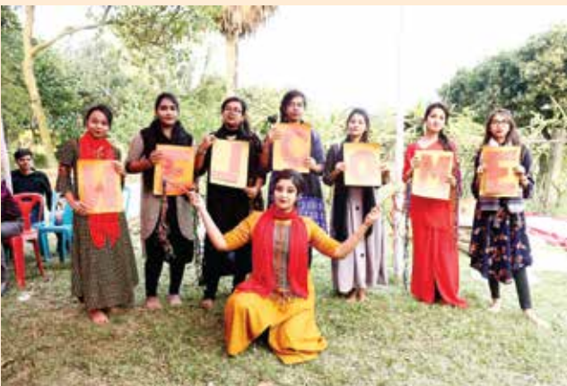
Student`s performance in Day out -2022

Extra-curricular activities like sports, literary and cultural program, publishing monthly, yearly and wall-magazine, conducting seminar and debate on various national and religious days, and picnic on different spots are arranged for the physical, mental and spiritual development of the students.