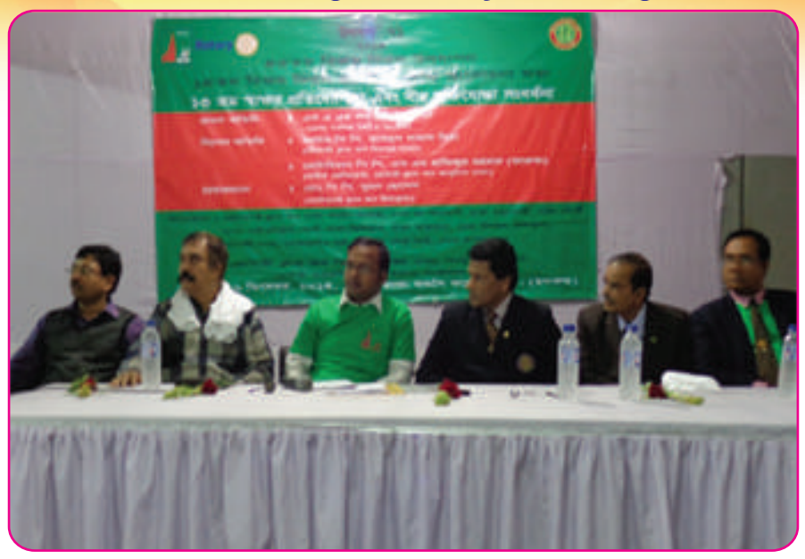
Victory Day discussion meeting 2014 at Dhaka Commerce College