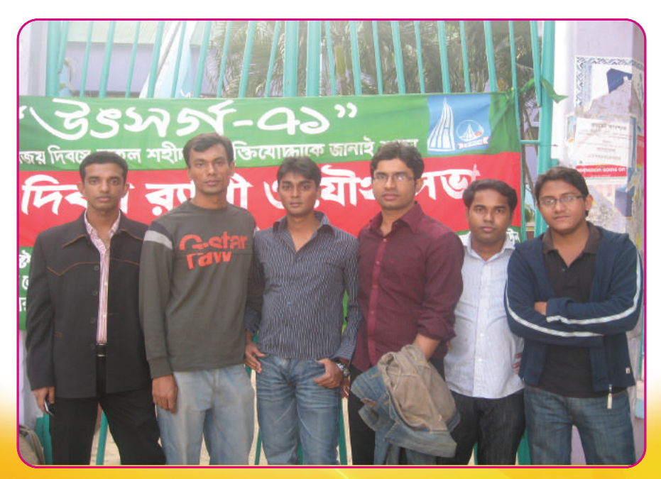
DCC Rotaractors at Victory Rally 2011 Infront of Indoor Stadum, Mirpur