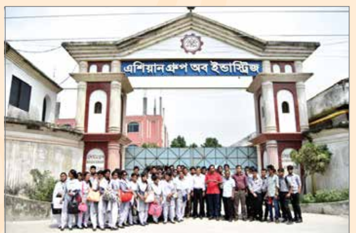
A visit to Asian Group of Industries in Munshigonj