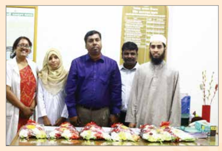
Reception of new faculties by the Department of Business Administration