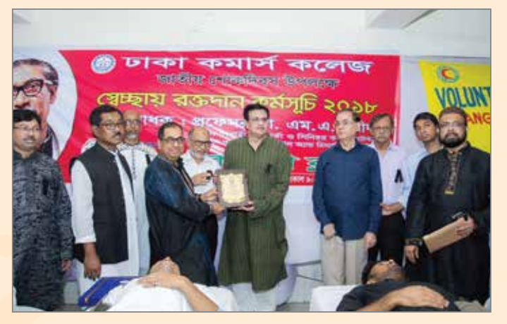
Blood donation campaign held in Dhaka Commerce College on the occasion of National Mourning Day 2018