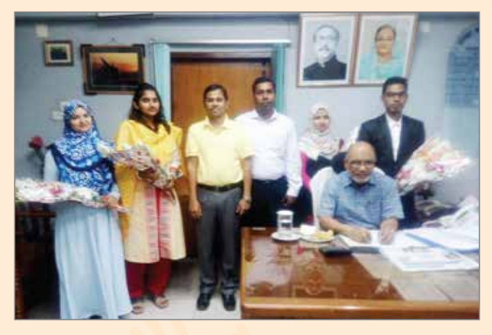
New faculties received by the Principal of Dhaka Commerce College