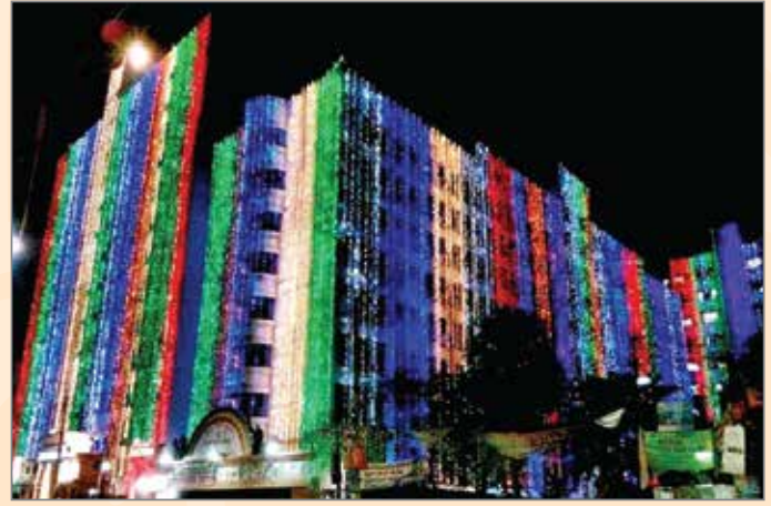
On the occasion of the celebration of the 'Silver Jubilee' stands the college building in its luster