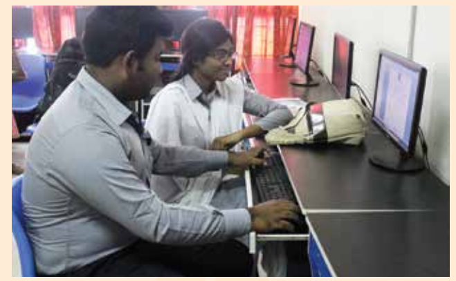
Students working in computer lab

A help desk will remain functional on the college campus for online application submission and for related information from 01/09/2018.