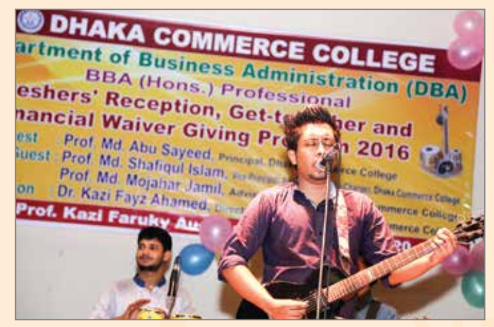
Cultural Activities: Music being performed by the BBA students on the occasion of Fresher's receptions, Financial Waiver Giving Ceremony & Get Together Program 2016