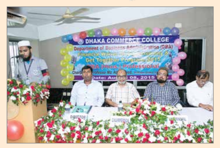
A student expresses his feelings on the occasion of Financial Waiver Giving Ceremony & Get Together Program 2015