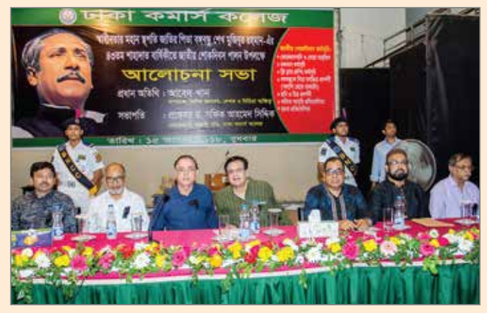
A discussion program being held on the occasion of the National Mourning Day 2018; renowned Journalist Abed Khan is the chief guest