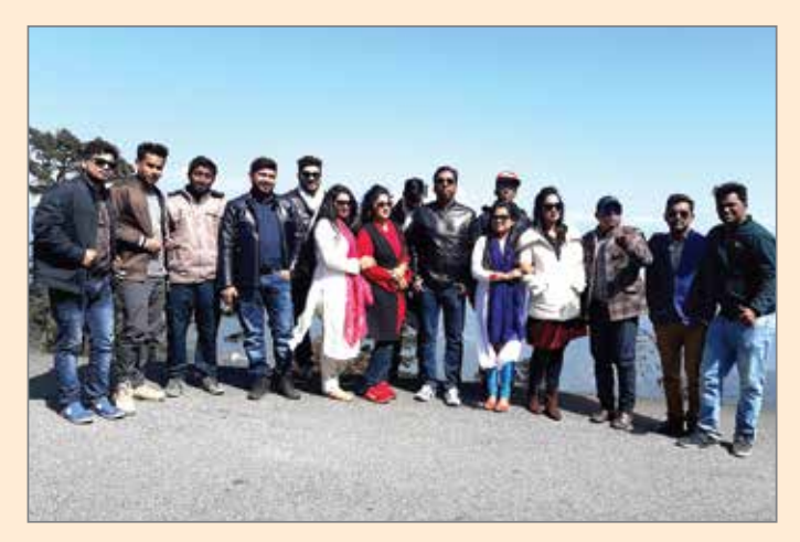
SAARC Tour 2018