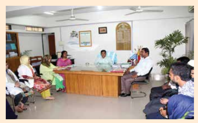
BBA Faculties during departmental meeting