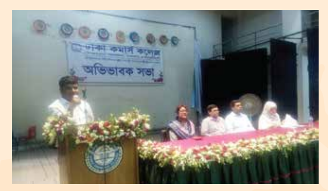
Guardian Meeting 2018

BBA Professional Program is a four-year program where teaching and examination of allocated courses for a specific semester would be finished within six months. Students will automatically be transferred to the next semester after examination pending the result. The basic structure of the four-year BBA Professional Program is as follows: