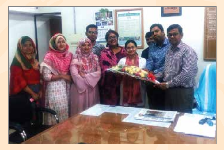
New faculty received by the Director of the Department of Business Administration