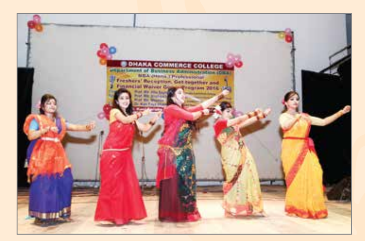
Cultural Activities: Dance being performed by the BBA students.