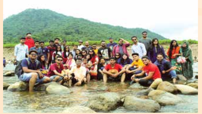
Study tour 2018 (Bichanakandi, Sylhet)

For the flourishing of leadership quality, students are assigned with various activities of the college and best activist or personality is awarded.