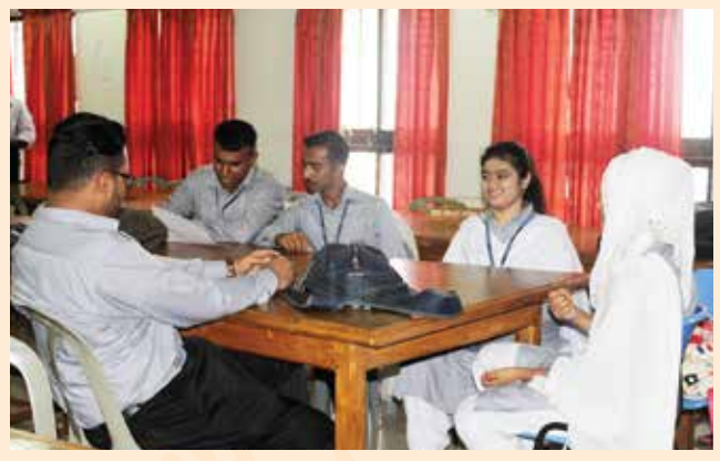
Students' group study in seminar

The selected students have to submit a medical certificate that she/he is free from any type of contagious or chronic diseases. If any disease is found later on, his/her admission will be cancelled.