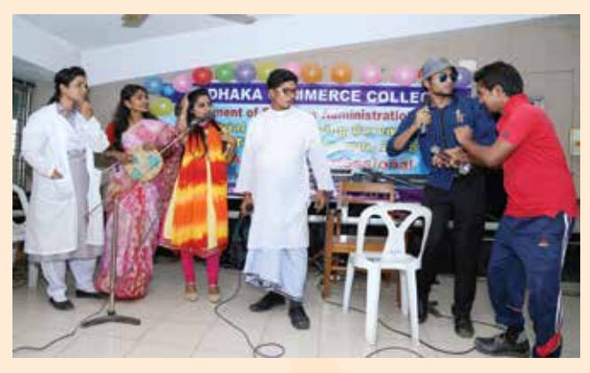
Cultural Activities: Drama Staged by BBA Students

Promotion: Results of two semesters in each academic year will be calculated for promotion to next year (1st year to 2nd year). The student must appear at the semester final examination in all courses and pass at least 60 percent of the total courses for example, 6 (six) out of 10 (ten) courses with a grade of D or above. Same rules will be applicable for promotion to the subsequent years that is, 2nd to 3rd and 3rd to 4th year.