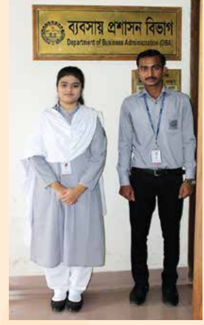
Uniform of the BBA Students

All Students should wear the dress and badge determined by the college. Without uniform and after schedule time no student is allowed to enter the college.