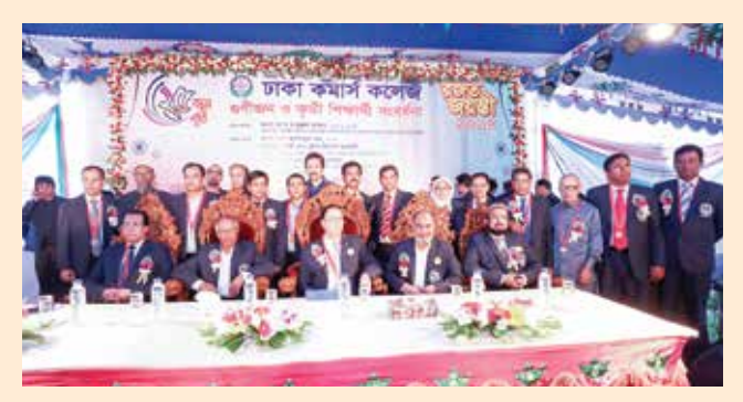
The gold medalists, with the Governing Body Chairman, members, Principal and Vice Principal, Administration of the college on the stage. They are awarded gold medals by the college on the occasion of the Silver Jubilee for their outstanding success in their respective fields

We will build you up as a well-educated and self-educated person through discipline, and diligence which will take you to the zenith of success in every sphere of your future life. Our careful nursing will establish a strong foundation of your future life. Your present preparation is indispensable for yourself and for the nation in future.