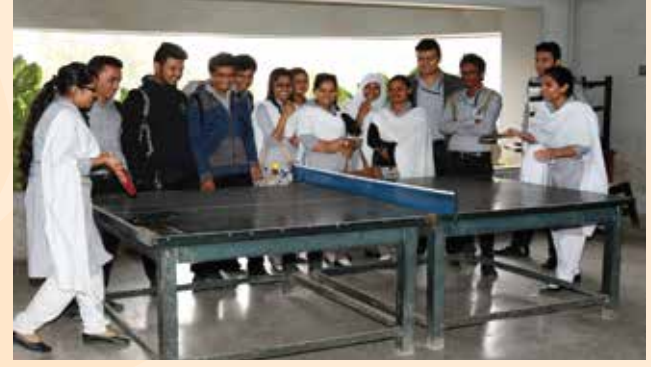
Students playing Table Tennis