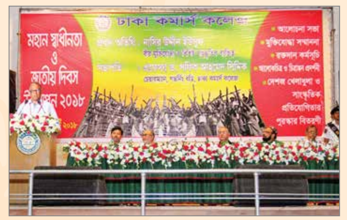
The renowned cultural personality and Freedom Fighter Nasir Uddin Yousuf is delivering his speech in the program of the Independence Day 2018