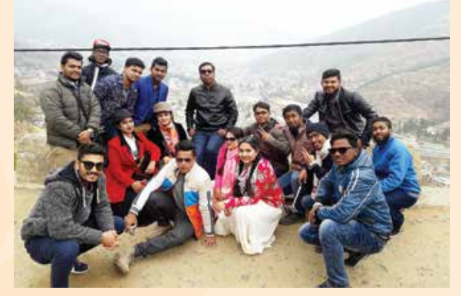
SAARC Tour 2018

Study tours or excursions are arranged to different industrial factories, banks, stock exchange and different places of historical importance in different times of the year.