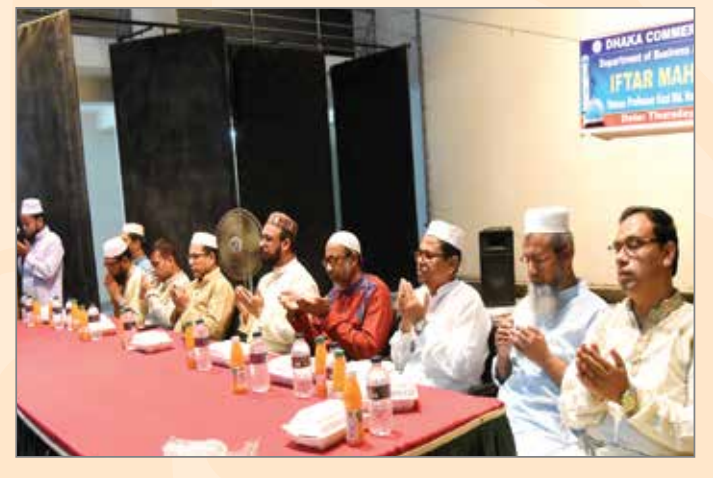
On the program of Iftar Mahfil 2018, arranged by the Department of BBA Students