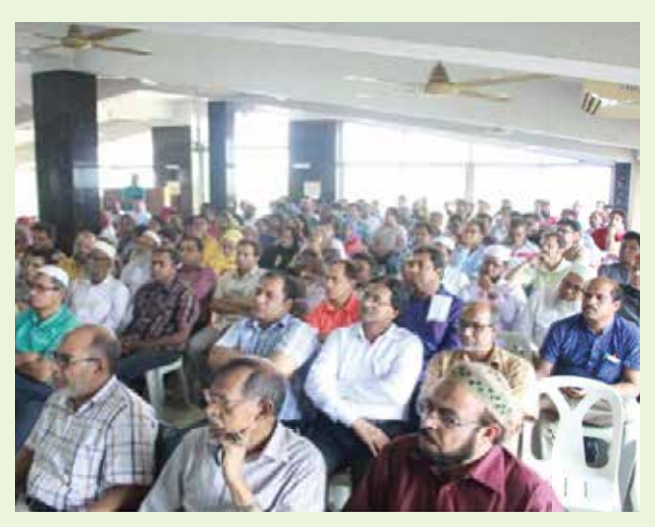
Website Workshop 11 April 2016