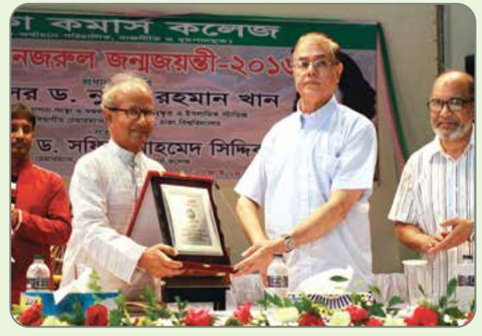
Rabindro-Nazrul birth celebration