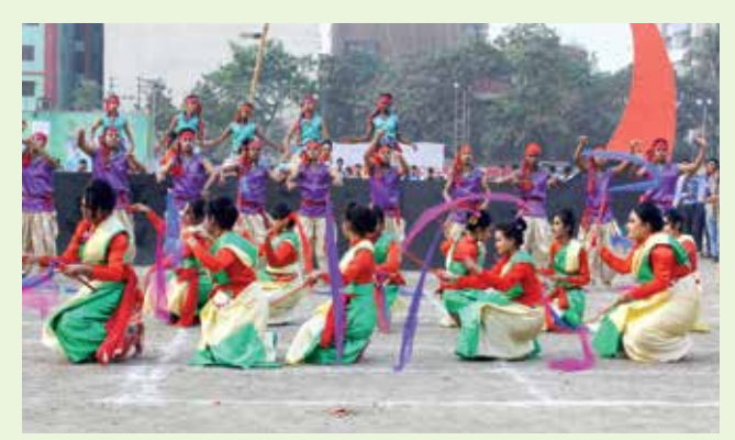
Performed by the college students in the annual sports program