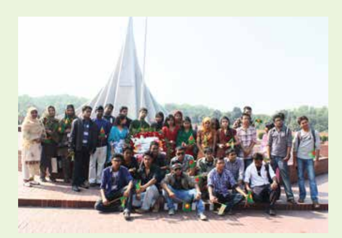
Study Tour of the college at Tea Garden in Sylhet