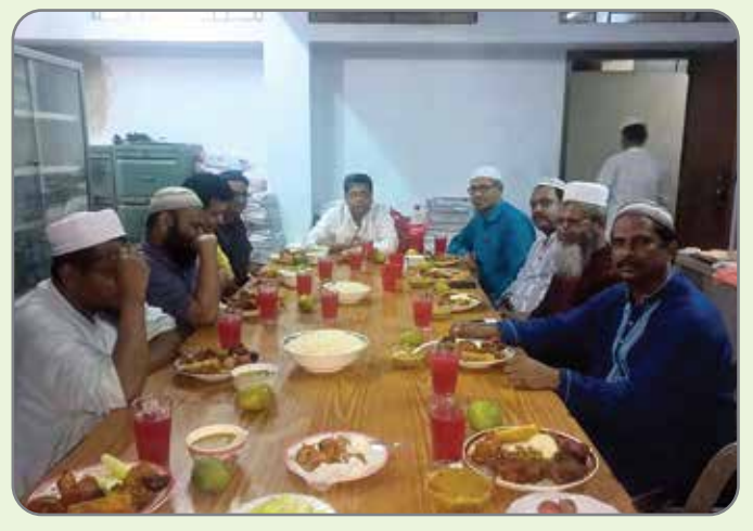
Iftar party 2017