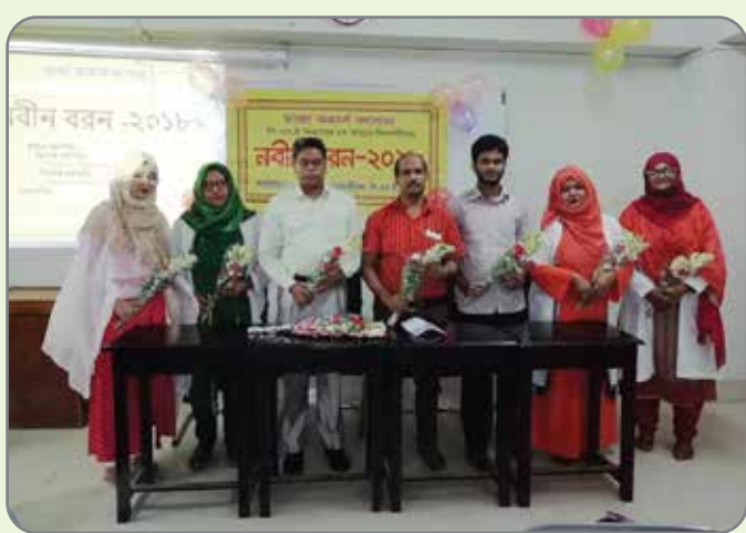
Freshers reciption program