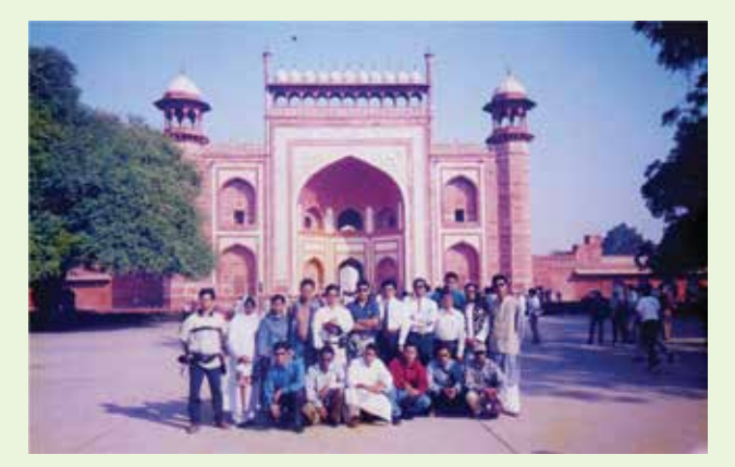
SAARC Tour of the college: At the front gate of the Taj Mahal, India

examination). In case of re-admitted students, the marks obtained earlier in the same semester courses only will be deleted from his/her record. However, a student will be usually readmitted in First, Third, Fifth, or Seventh semester only. In both the cases of retaking a course for failure or for improvement, a student must apply in specific form to the Controller of Examinations through the Head of the Department and through the Principal within 15 days of the publication of the provisional result. Semester results or yearly results (if combined for two semesters) will be considered as provisional.