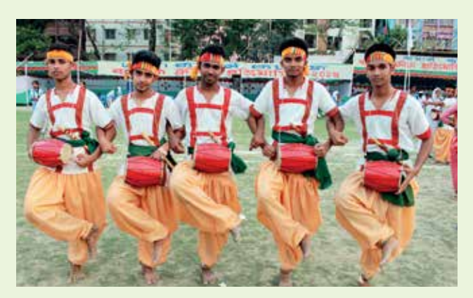
Dance being performed by the DCC students

The Bachelor of CSE program is a professional undergraduate program for individu- also who plan to develop their career as junior level IT Professionals.