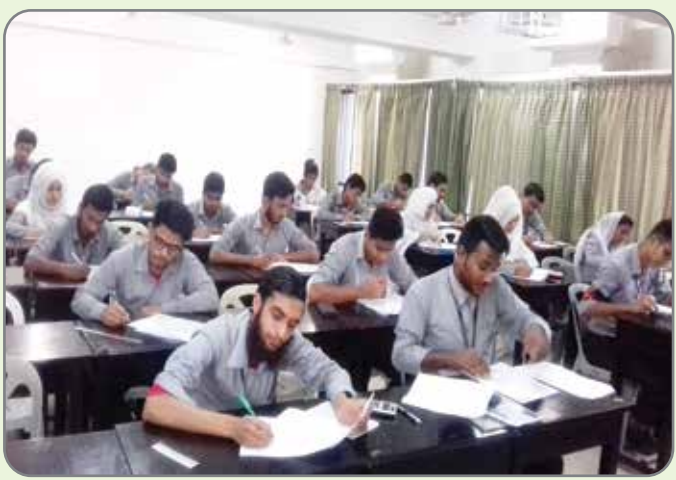
CSE students at class room