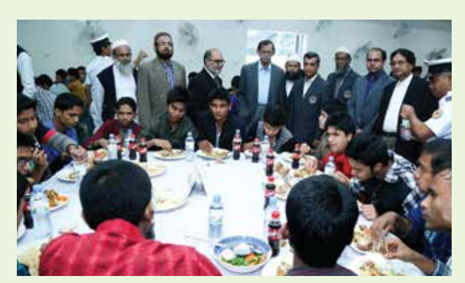
Annual Feast program of the college