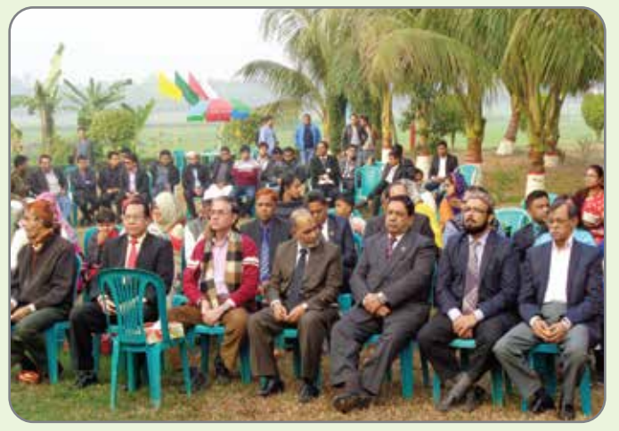
GB Chairman's Home