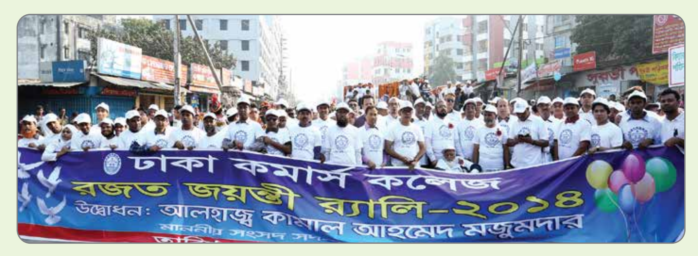
Silver Jubilee celebration program