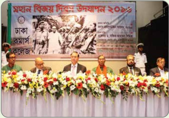
Victory day celebration 2016