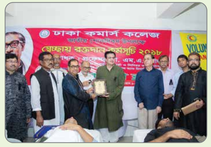
Blood donation campaign held in Dhaka Commerce College on the occasion of National Mourning Day 2018