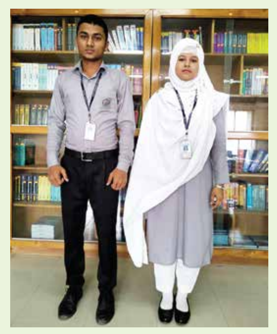
Students in CSE uniform

All Students should wear the dress and badge determined by the college. Without uniform and after schedule time no student is allowed to enter the college.