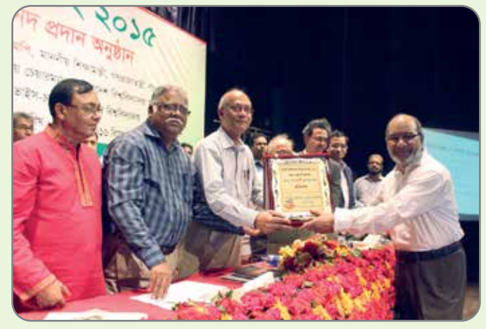
Dhaka Commerce College was awarded the best non-govt. college by National University in 2015.