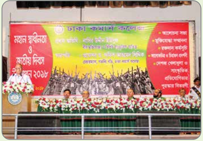
The renowned cultural personality and Freedom Fighter Nasir Uddin Yousuf is delivering his speech in the program of the Independence Day 2018