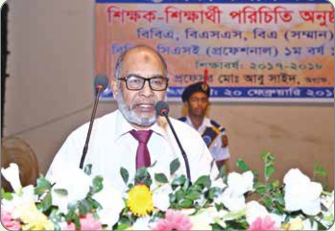
Teachers & Students introducing ceremony