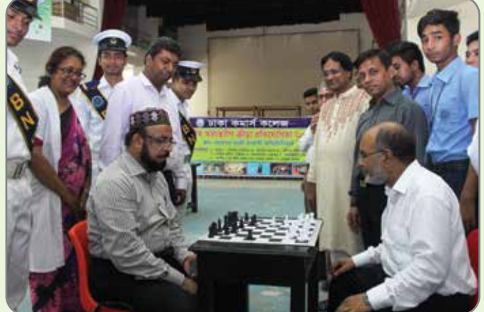
Principal and vice- Principal participating in indoor game (Chees)