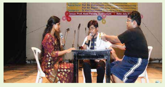
Drama staged by the CSE students

The selected students have to submit a medical certificate that she/he is free from any type of