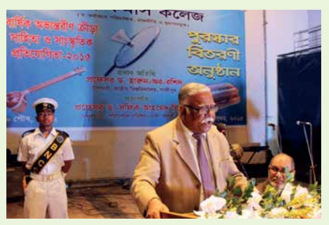
Prize giving ceremony at DCC

Candidates having completed the above formal- ities must pay the requisite fees. Enrolment in the college and admission into the classes are con- ditional upon completion of all admission formalities including payment of all fees in the Bank.