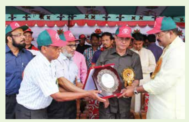
Annual Sports Program