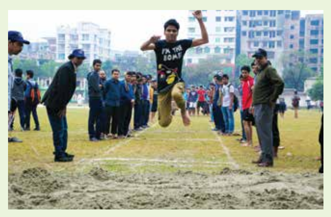
The annual sports of the college

Maximum five days leave of absence in each semester for a student may be granted under special circumstances for the application of the real/original guardian. However, such leave may not be granted in case of examination.