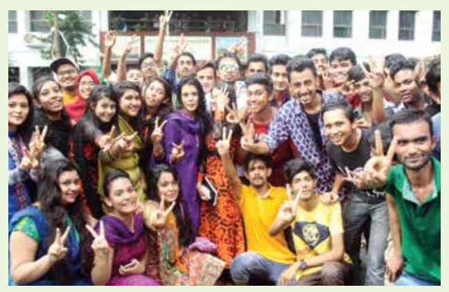
HSC result celebration-2017

A student earning D or more can opt for appearing in the Improvement Examination (except for Viva and Project Paper Defense) with next immediate available batch only, but only once for one course. In that case the earlier grade (and also the relevant marks, if any) earned in the course will be deleted. All midterm and assignment marks will remain unchanged in case of a student appearing in any improvement examination (i.e., improvement will depend only on the course final