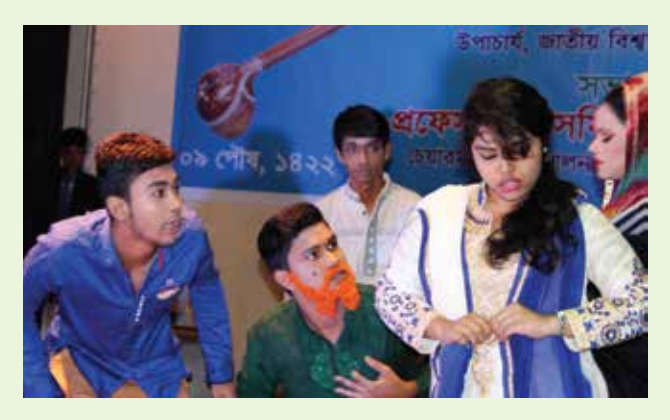
Performance of Drama Club, DCC

Study tours or excursions are arranged to different industrial factories, banks, stock exchange and different places of historical importance in different times of the year.