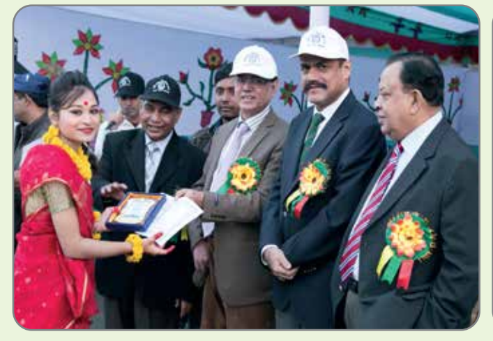
Annual Sports Program