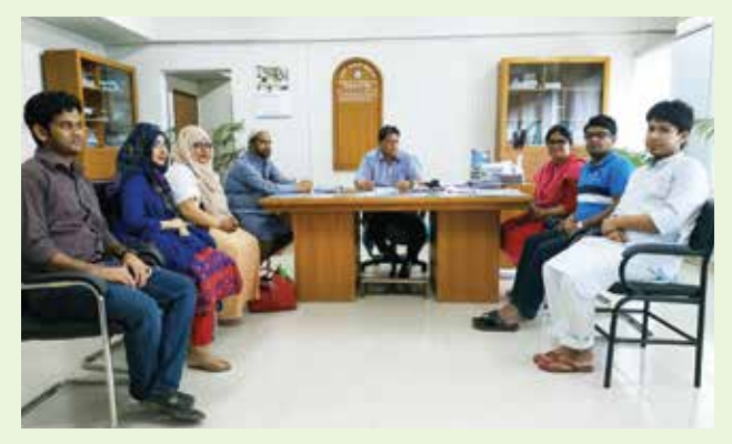
Conduction departmental Meeting

he/she fails to qualify for the degree within six consecutive academic years and an additional period of six months for Viva and Project Paper Defense, being a regular student, he/she will automatically be dropped from the program. A regular student can get himself re-admitted for a maximum of two times. In such cases too he/she also must earn the degree within a maximum period of six consecutive academic years with an additional time of six months for Viva and Project Paper Defense. Rules for non-collegiate students are to be determined and applied separately by the National University.