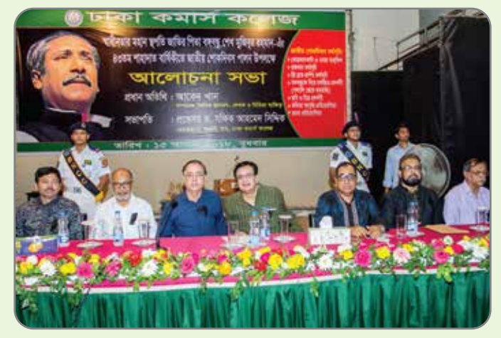
A discussion program being held on the occasion of the National Mourning Day 2018; renowned Journalist Abed Khan is the chief guest