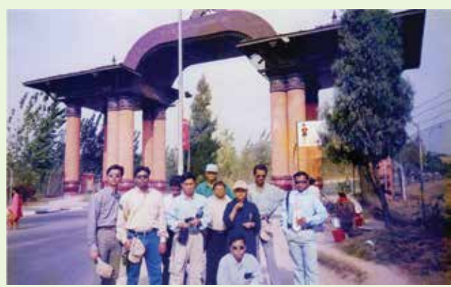
SAARC Tour of the college: In front of Tri Bhubon Intl. Airport, Nepal