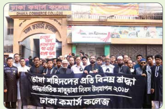
International mother language day celebreation