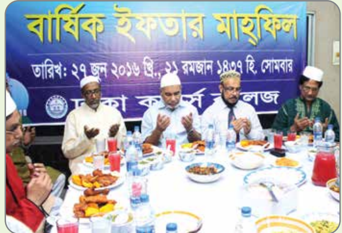
Iftar party at DCC