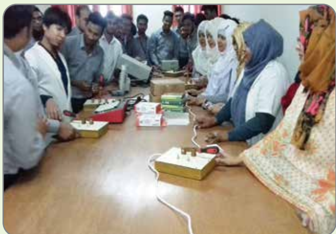
Teacher and Students at EEC Lab