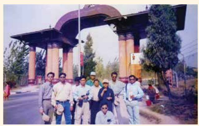
SAARC Tour of the college: In front of Tri Bhubon Intl. Airport, Nepal