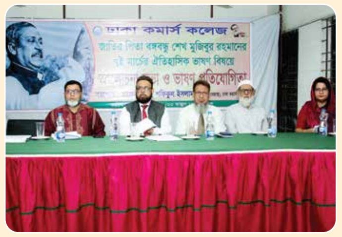
Seminar & Speech competition on the occasion of 7th March 2020