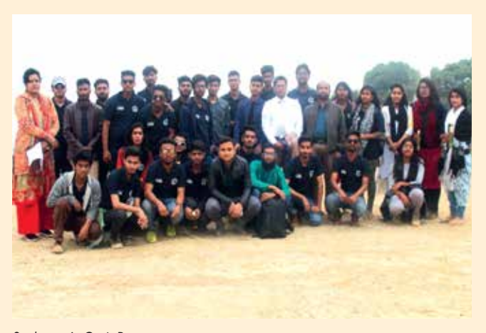
Study tour in Cox's Bazar.

Candidates having completed the above formalities must pay the requisite fees. Enrolment in the college and admission into the classes are conditional upon completion of all admission formalities including payment of all fees in the Bank.