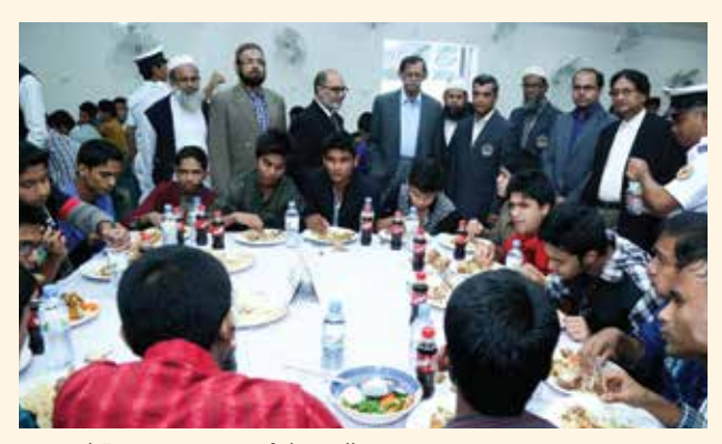
Annual Feast program of the college