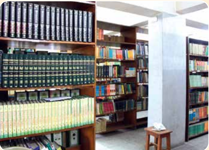
Part of central library of the college