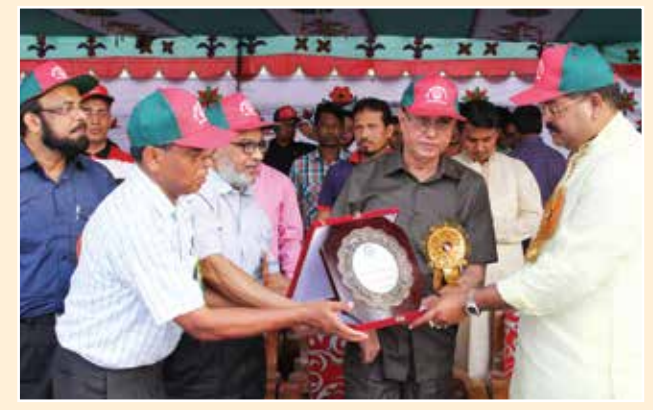
Annual Sports Program

IT education is critical in the process of technological development of a developing country like ours. The need for competent IT expert required to run an organization effectively is increasing day by day throughout the whole world. To mitigate this need, Dhaka Commerce College launched CSE Program in 2016-2017 session. The college received the best college award from the Government in 1996 and in 2002. In 2015, 2016 and in 2017 it was awarded the best non-govt. college by National University.