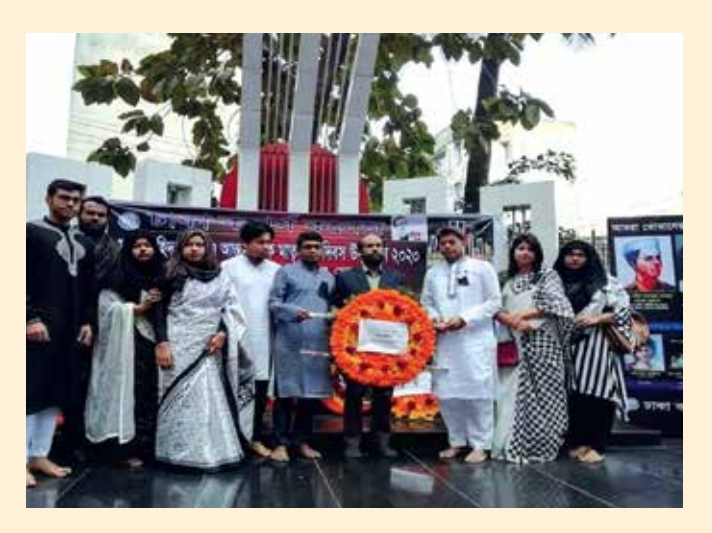
Teachers of CSE department are handing over wreath at Shaheed Minar.