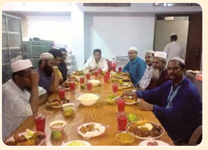
Iftar party 2017