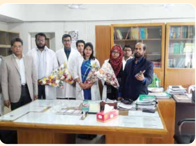
Ekushe Boi Mela -2020 at Dhaka Commerce College premises arranged Faculties of CSE department are giving their best wishes to the newly appointed Lecturers