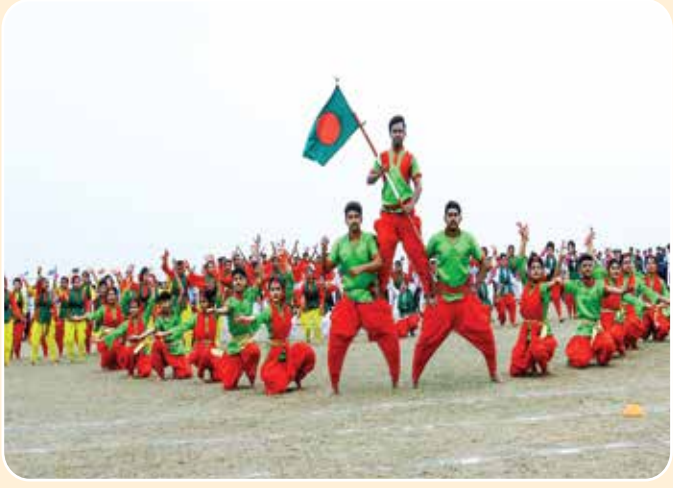
Students performing at Annual Sports Program 2020