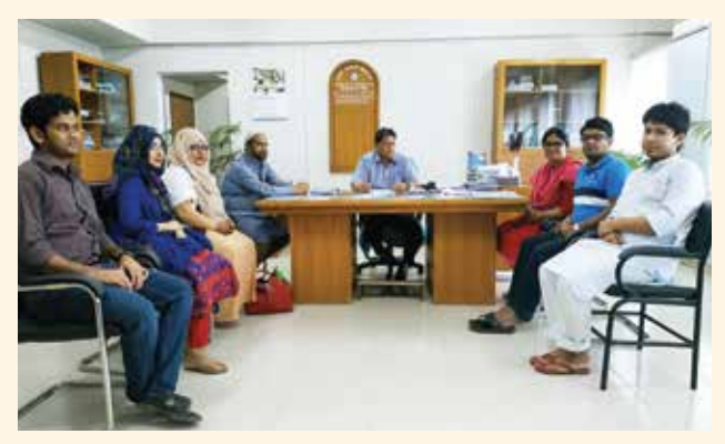
Conduction departmental Meeting

he/she fails to qualify for the degree within six consecutive academic years and an additional period of six months for Viva and Project Paper Defense, being a regular student, he/she will automatically be dropped from the program. A regular student can get himself re-admitted for a maximum of two times. In such cases too he/she also must earn the degree within a maximum period of six consecutive academic years with an additional time of six months for Viva and Project Paper Defense. Rules for non-collegiate students are to be determined and applied separately by the National University.