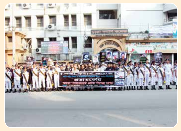
Provath Ferry on the occasion of International Mother Language Day 2020