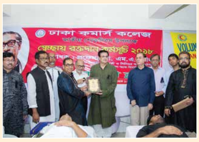
Blood donation campaign held in Dhaka Commerce College on the occasion of National Mourning Day 2018