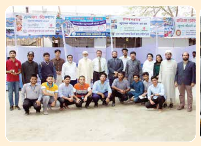
by the students