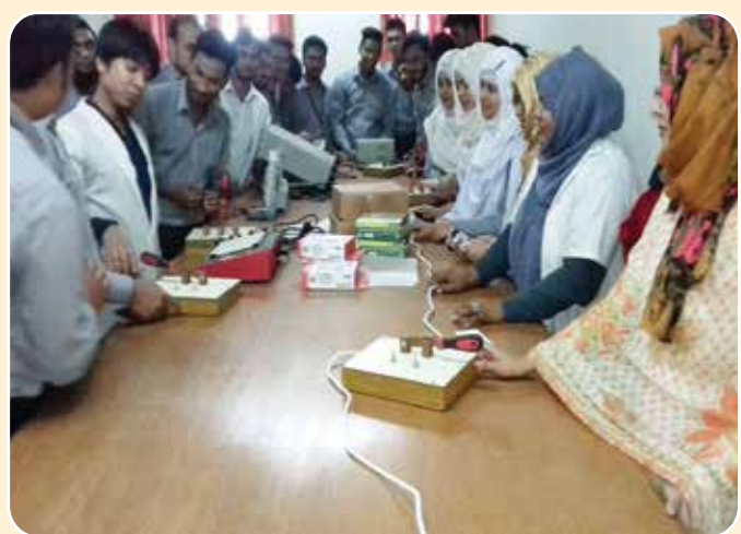
Teacher and Students at EEC Lab