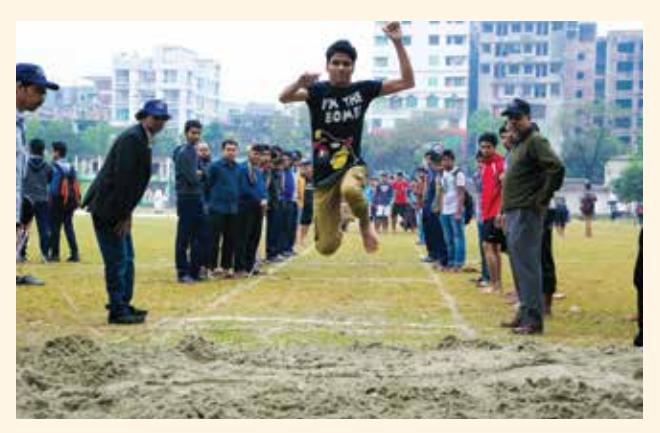
The annual sports of the college

Maximum five days leave of absence in each semester for a student may be granted under special circumstances for the application of the real/original guardian. However, such leave may not be granted in case of examination.