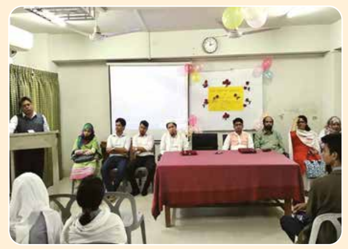
Discussion of Career Development