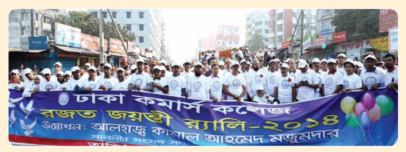
Silver Jubilee celebration program