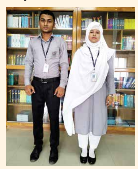
Students in CSE uniform

All Students should wear the dress and badge determined by the college. Without uniform and after schedule time no student is allowed to enter the college.