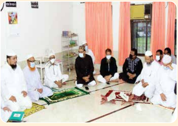
The Principal & other teachers are praying for the Father of the Nation on the occasion of National Mourning Day 2020