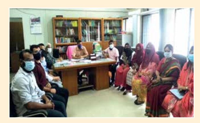
Departmental meeting regarding covid-19

The printed application form must be submitted to the college office along with attested photocopies of SSC/O Level, HSC/A Levels transcripts, registration cards and online application fee of Tk. 300 by 29/09/2021 between 9:00 am and 5:00 pm on all working days.