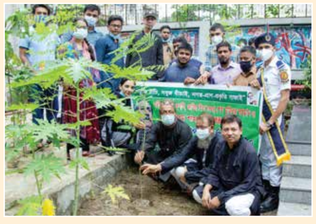
Tree plantation program on the occasion of National Mourning Day 2020