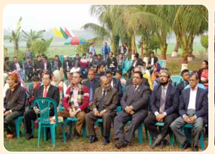
GB Chairman's Home