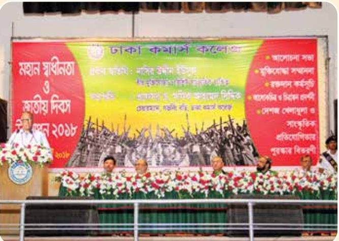
The renowned cultural personality and Freedom Fighter Nasir Uddin Yousuf is delivering his speech in the program of the Independence Day 2018