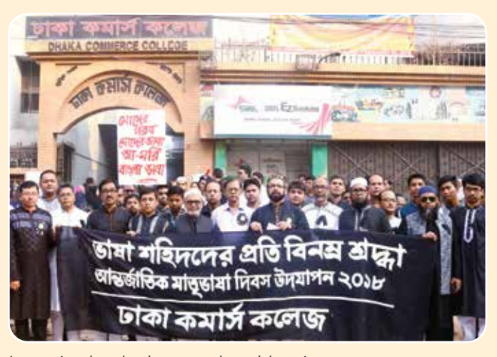
International mother language day celebreation