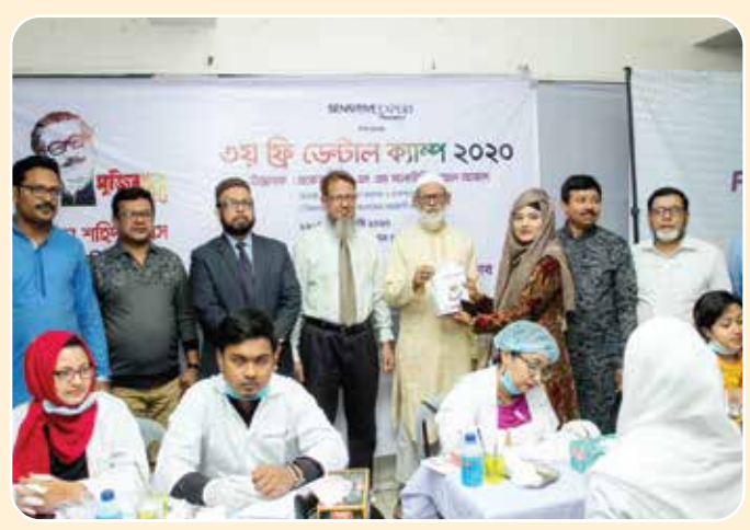
Free dental campaign on the occasion of International Mother Language Day 2020