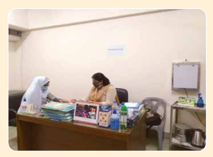
A CSE student is taking medical service from medical department of the college