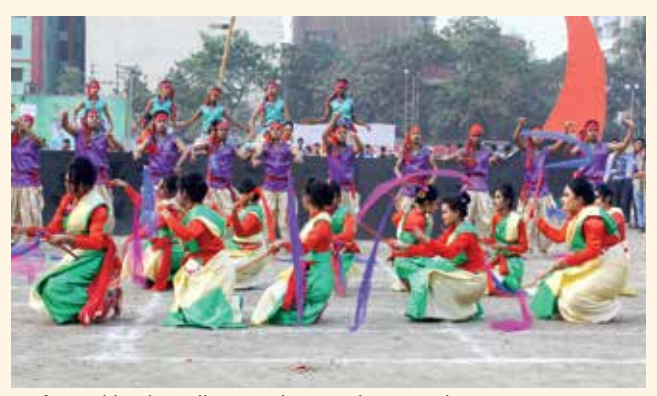
Performed by the college students in the annual sports program