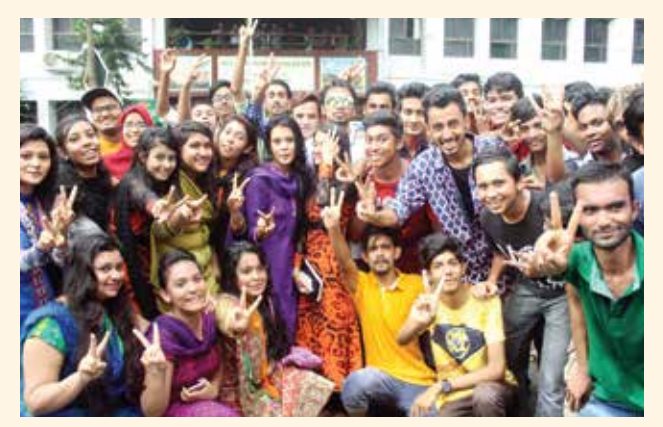
HSC result celebration-2017

A student earning D or more can opt for appearing in the Improvement Examination (except for Viva and Project Paper Defense) with next immediate available batch only, but only once for one course. In that case the earlier grade (and also the relevant marks, if any) earned in the course will be deleted. All midterm and assignment marks will remain unchanged in case of a student appearing in any improvement examination (i.e., improvement will depend only on the course final