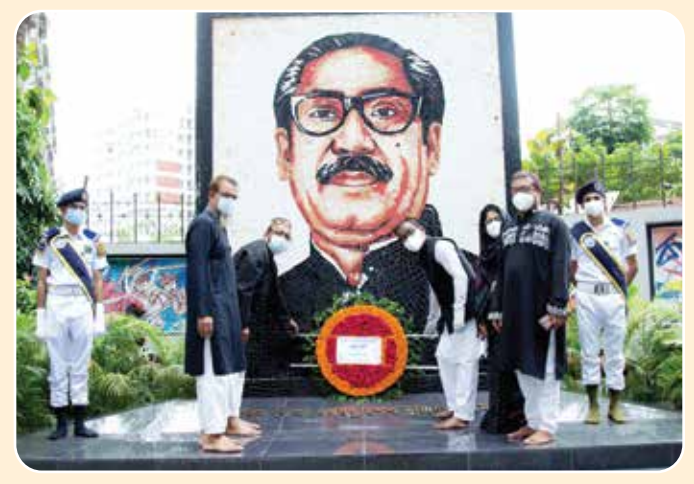
Wreath laid by the member of GB at the memorial of Father of the Nation Bangabandhu Sheikh Mujibur Rahman on the occasion of National Mourning day