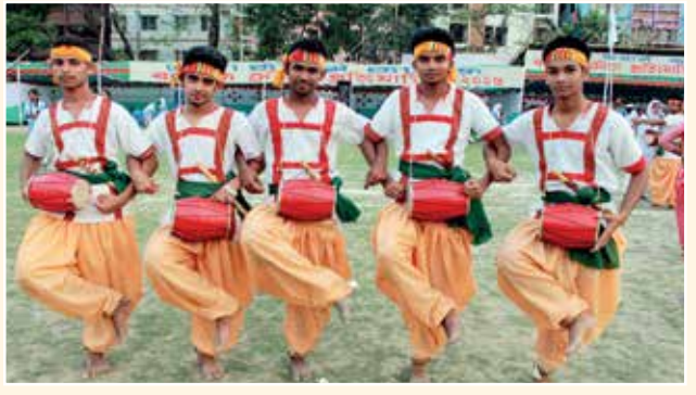
Dance being performed by the DCC students