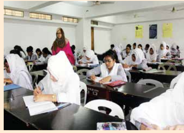
Students of BBA program are in the Exam Hall

Midterm examinations, tutorials, class tests, quizzes are held regularly with a view to flourishing their talent and for internal evaluation. Besides, students have to participate in case studies, presentations and submit assignment. It is mandatory for the students to take part in the internal examinations. In no way, students are allowed to remain absent from the examinations. Sick-beds are arranged for ailing students for conducting examinations. Admission is cancelled or transfer certificate is given to the students who remain absent from the examination.