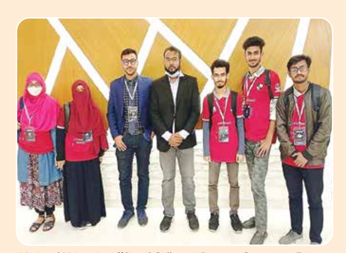
National University Affiliated Colleges "Program Contest" at Tejgaon