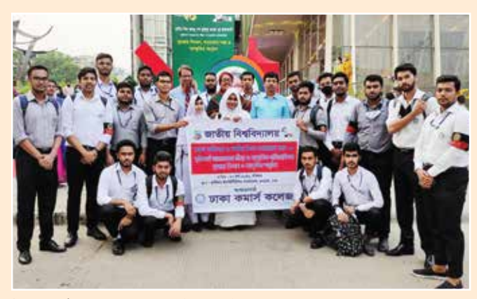
National University Prize Giving Ceremony

We will build the student as a well-educated and self-educated person through discipline, and diligence which will take you to the zenith of success in every sphere of your future life. Our careful nursing will establish a strong foundation of your future life. Your present preparation is indispensable for yourself and for the nation in future.