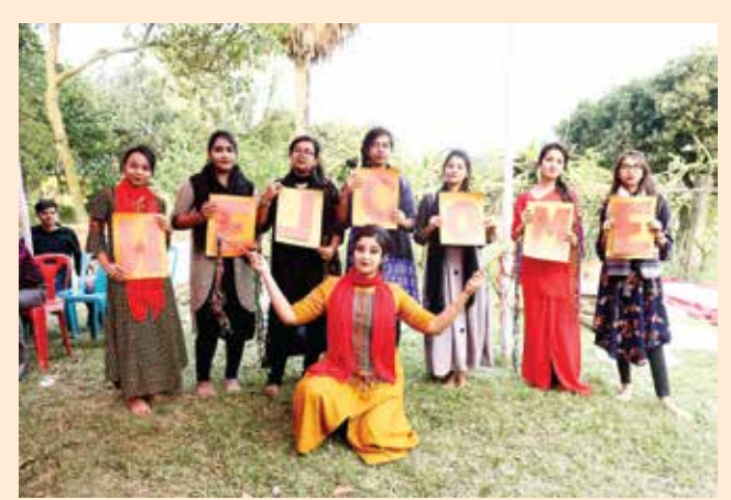
Student's performance in Day out -2022

Extra-curricular activities like sports, literary and cultural program, publishing monthly, yearly and wall-magazine, conducting seminar and debate on various national and religious days, and picnic on different spots are arranged for the physical, mental and spiritual development of the students.