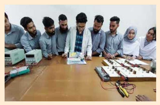
CSE EEC Lab

Our hardware lab has all the required equipment for practicing the hardware related courses. Students can learn by using them directly and practicing more. Our software lab has latest computers that support every software related to the course and also for extra learning. Students can even use the computer lab after class for more practice.