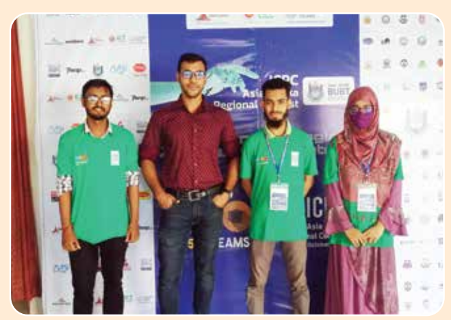
Students Participating in ACM ICPC Asia Dhaka regional contest final

Students will be supplied with books and materials which they will be required to read and understand. To develop sound study habits, arrangements are made for supervised reading in the library of the college. Students prepare daily work required to assignments, participate in class discussions and sit for periodical quizzes and tests. Arrangements will be made to hold lectures and research seminars by prominent business executives or academicians on subjects of current business and research interest.