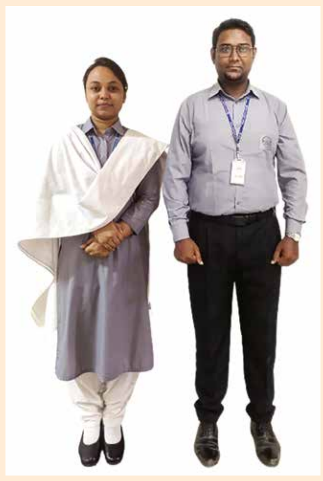
Uniform of the BBA & CSE Students

N.B. To enter the college for other purposes every student should put on college uniform.