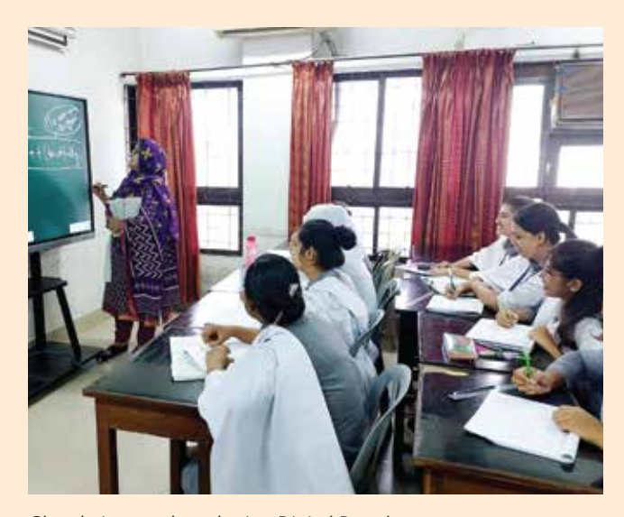
Class being conducted using Digital Board

Guardians (only ID card holders) are allowed to meet with the students during class hours only with the prior permission of the authority. Such permission is given in case of emergency.