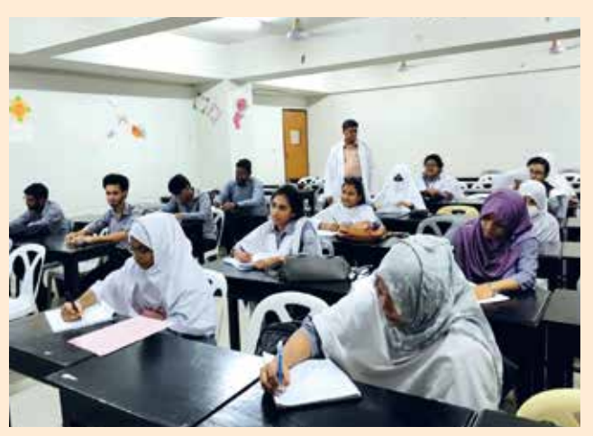
Students of CSE program are in the Exam Hall