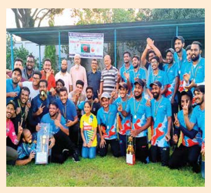
Inter Batch Cricket Tournament arranged by BBA Department

With a view to creating competitive mentality, competition on debates, sports, literary and cultural activities and on cleanliness are held among the students on the basis of section and class.