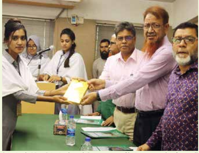
Principal, Vice-Principal and Department Chairman at the farewell ceremony of the first batch