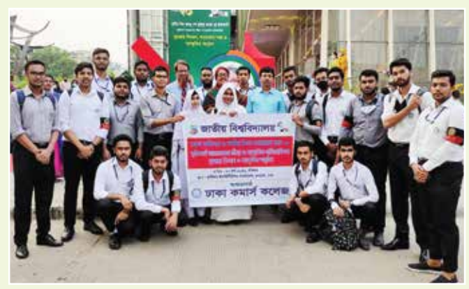
National University Prize Giving Ceremony

We will build the student as a well-educated and self-educated person through discipline, and diligence which will take you to the zenith of success in every sphere of your future life. Our careful nursing will establish a strong foundation of your future life. Your present preparation is indispensable for yourself and for the nation in future.