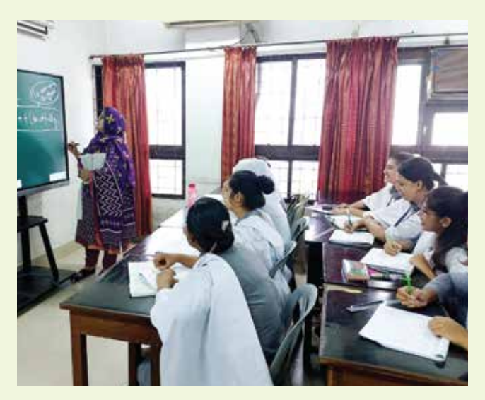
Class being conducted using Digital Board

Guardians (only ID card holders) are allowed to meet with the students during class hours only with the prior permission of the authority. Such permission is given in case of emergency.