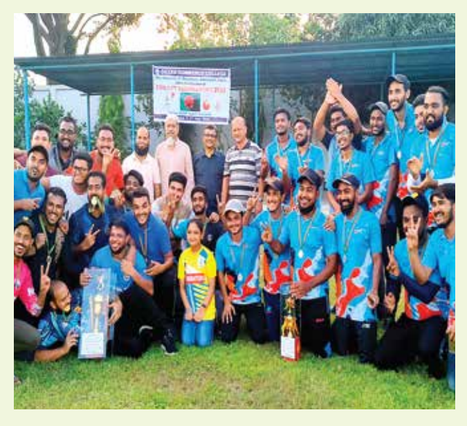
Inter Batch Cricket Tournament arranged by BBA Department

With a view to creating competitive mentality, competition on debates, sports, literary and cultural activities and on cleanliness are held among the students on the basis of section and class.