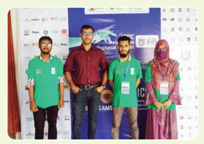
Students Participating in ACM ICPC Asia Dhaka regional contest final

Students will be supplied with books and materials which they will be required to read and understand. To develop sound study habits, arrangements are made for supervised reading in the library of the college. Students are required to prepare daily work assignments, participate in class discussions and sit for periodical quizzes and tests. Arrangements will be made to hold lectures and research seminars by prominent business executives or academicians on subjects of current business and research interest.