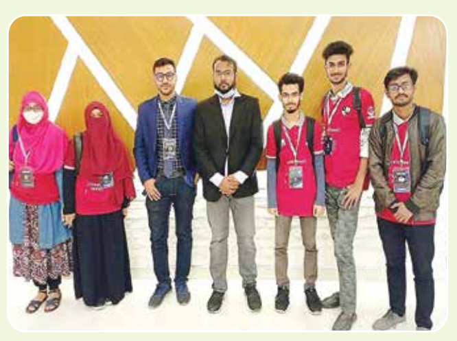
National University Affiliated Colleges "Program Contest" at Tejgaon College