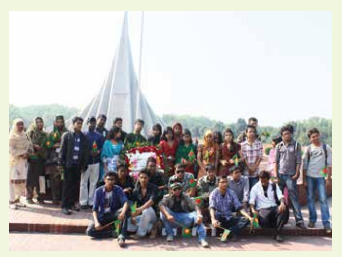
Students visiting National memorial

Even if needed be, the registration in the university may be cancelled. Any recommendation or persuasion about this will be treated as the double crime.