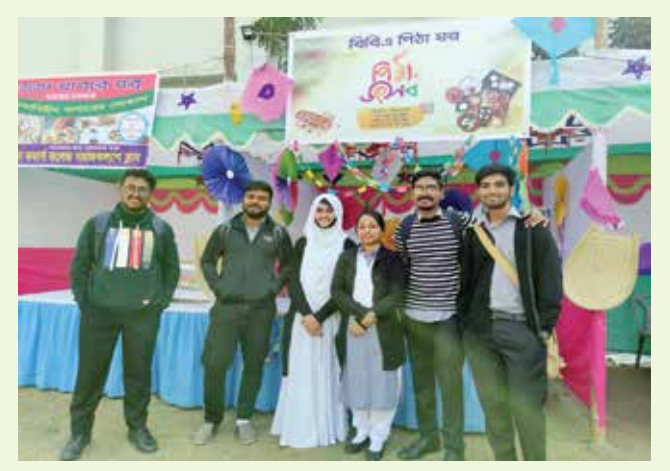
BBA students participated in Pitha Utsab

Extra-curricular activities like sports, literary and cultural program, publishing monthly, yearly and wall-magazine, conducting seminar and debate on various national and religious days, and picnic on different spots are arranged for the physical, mental and spiritual development of the students.