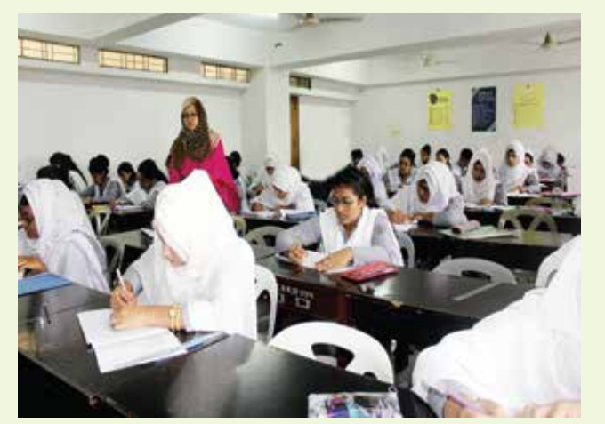
Students of BBA program are in the Exam Hall

Midterm examinations, tutorials, class tests, quizzes are held regularly with a view to flourishing their talent and for internal evaluation. Besides, students have to participate in case studies, presentations and submit assignment. It is mandatory for the students to take part in the internal examinations. In no way, students are allowed to remain absent from the examinations. Sick-beds are arranged for ailing students for conducting examinations. Admission is cancelled or transfer certificate is given to the students who remain absent from the examination.