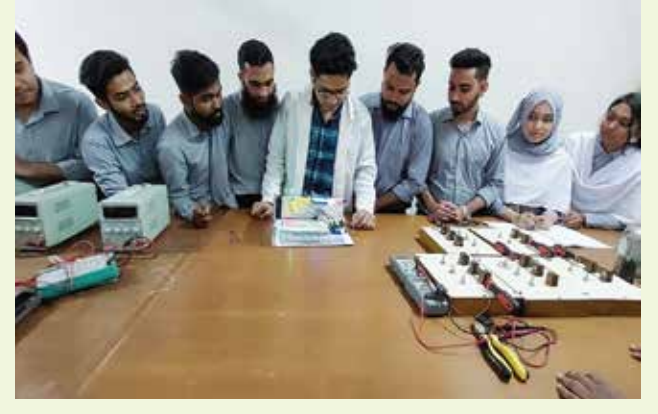
CSE EEC Lab

Our hardware lab has all the required equipment for practicing the hardware related courses. Students can learn by using them directly and practicing more. Our software lab has latest computers that support every software related to the course and also for extra learning. Students can even use the computer lab after class for more practice.