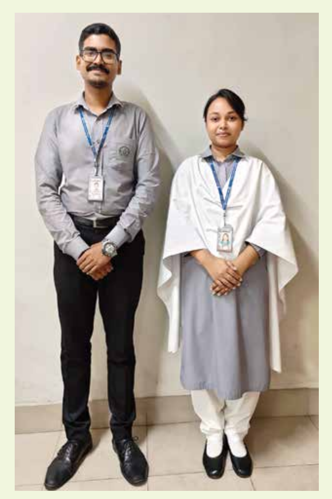
Uniform of the BBA & CSE Students

N.B. To enter the college for other purposes every student should put on college uniform.