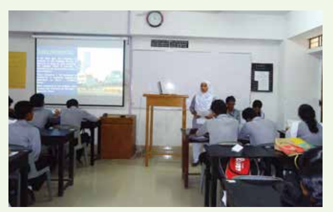
Student delivering prestation