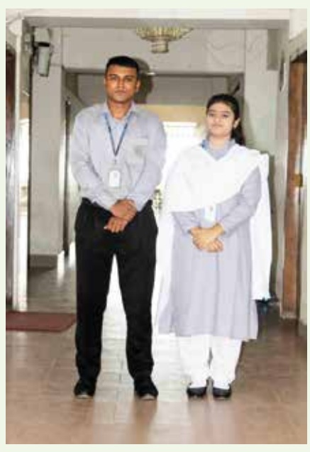
Uniform of BBA Students

All Students should wear the dress and badge determined by the college. Without uniform and after schedule time no student is allowed to enter the college.