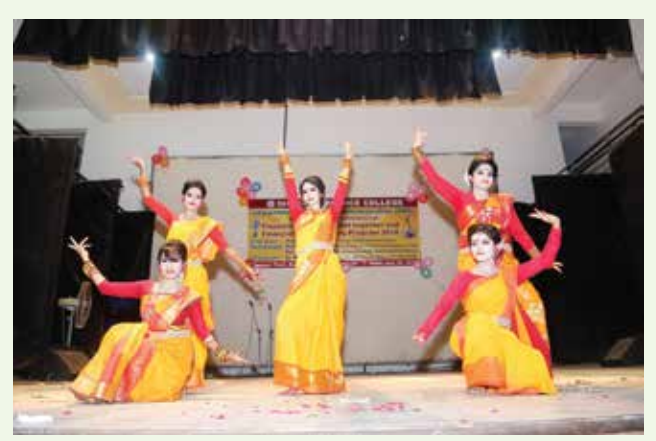
Dance being performed by the BBA students.

Views exchanging meetings among students, guardians and teachers are held on a date fixed by college/departmental authority or after the exams. It is a must for the guardians to be present there. Infect an examinee's progress in study or overall development depends on the united efforts of the students, teachers and guardians. In this way the students can make good results.