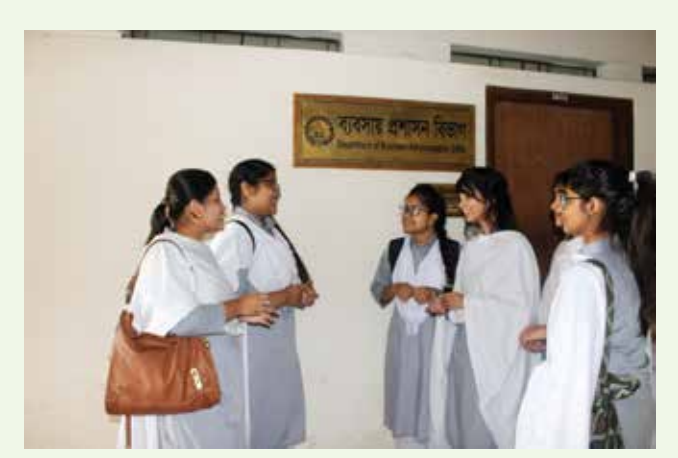
Students in front of department

Guardians (only ID card holders) are allowed to meet with the students during class hours only