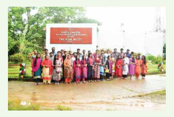
Study tour 2018- Shylet