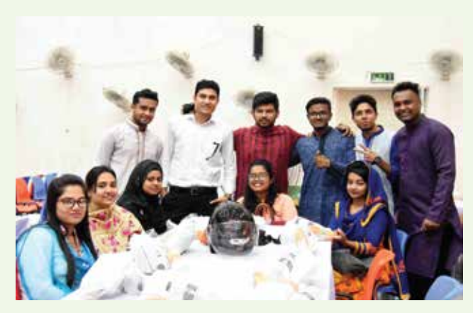
BBA students participating in Iftar Mahfil

The college has no students' council. But there is a students' welfare council under the supervision