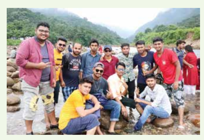
Study tour 2018- Bichanakandi, Shylet