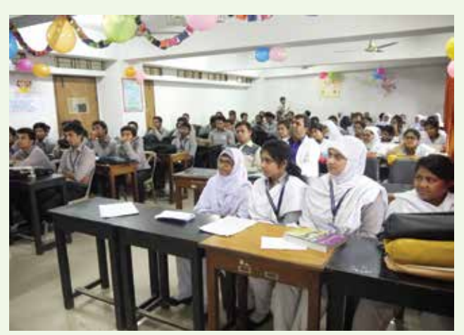
Evaluation of students' prestation