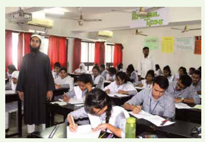
Students of BBA Program are in the Exam Hall.

The academic and administrative matters of the students of the program are looked after by the