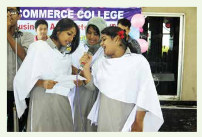
Group performance in cultural program

Any indecorous activity subversive of students is strictly prohibited while in uniform. Anybody involved in such activity must be turned out of the college on discipline ground.