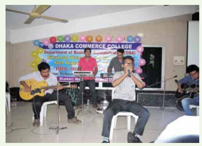
Music being performed by the BBA students

After collecting papers from accounts section of the college, semester tuition fees and other fees should be deposited in the collection centre of Social Islami Bank Ltd. at college premises on fixed date and time. Receipts of paying fees must be shown to the office of the college.